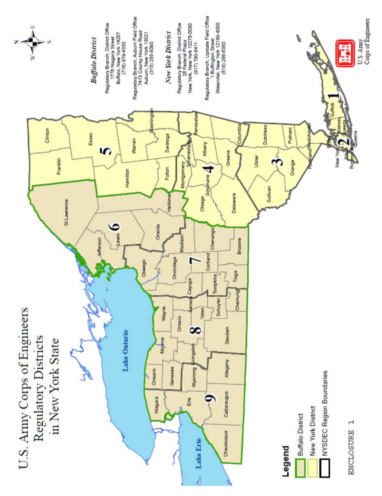
Final Regional Conditions, Water Quality Certification and Coastal Zone Concurrence for Nationwide Permit 19 – (Minor Dredging) within the New York District Regulatory Boundary in the State of New York Expiration March 18, 2022